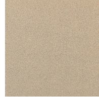
Champagne Cream - 26